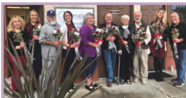
2018 marked the first year volunteers delivered Valentine’s roses to the Conejo Valley